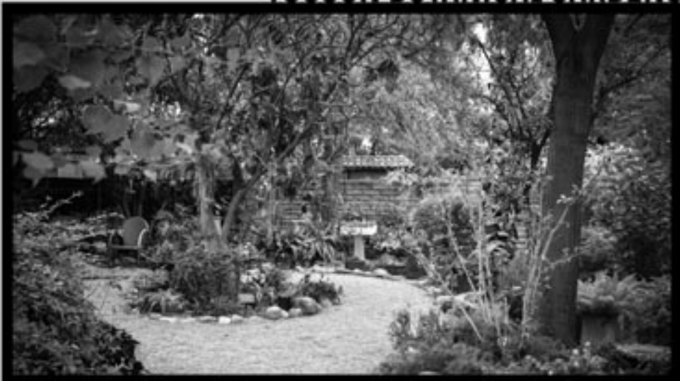
SUN TRAN ROUTES 9 & 11