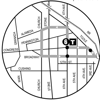
Downtown Detail (Detalle del Centro)

This route travels through our new On Demand Zone. See page 51 for route maps. Esta ruta viaja por nuestra nueva Zona On Demand. Vea la página 51 para mapas de rutas.