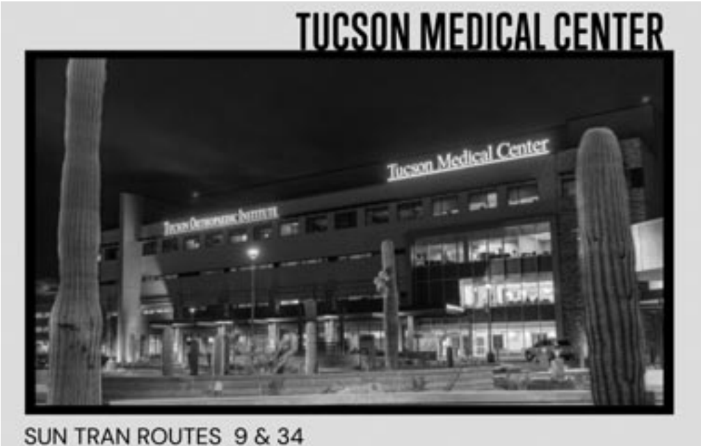
SUN TRAN ROUTES 9 & 34